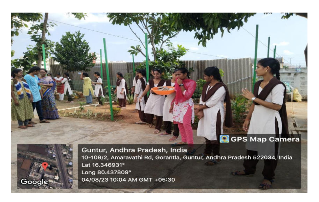
Clean & Green Program