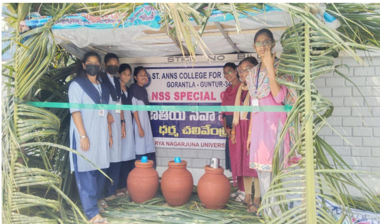
Free Cool Water Point