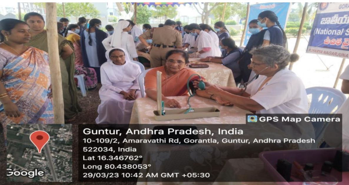
Free Health Camp